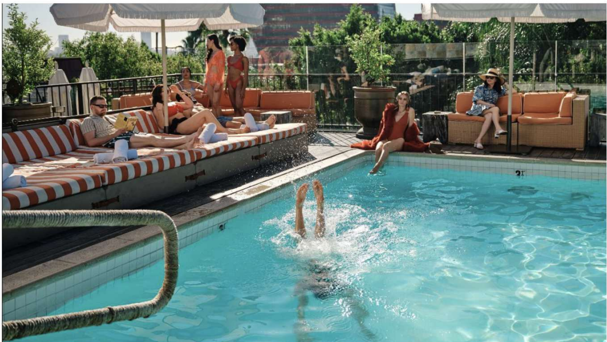
Petit Ermitage Hotel

From rooftop racquet sports and poolside yoga, to buzzy new dining openings and iconic skyline lounges, discover the elevated side of WeHo - morning, noon and well past golden hour.